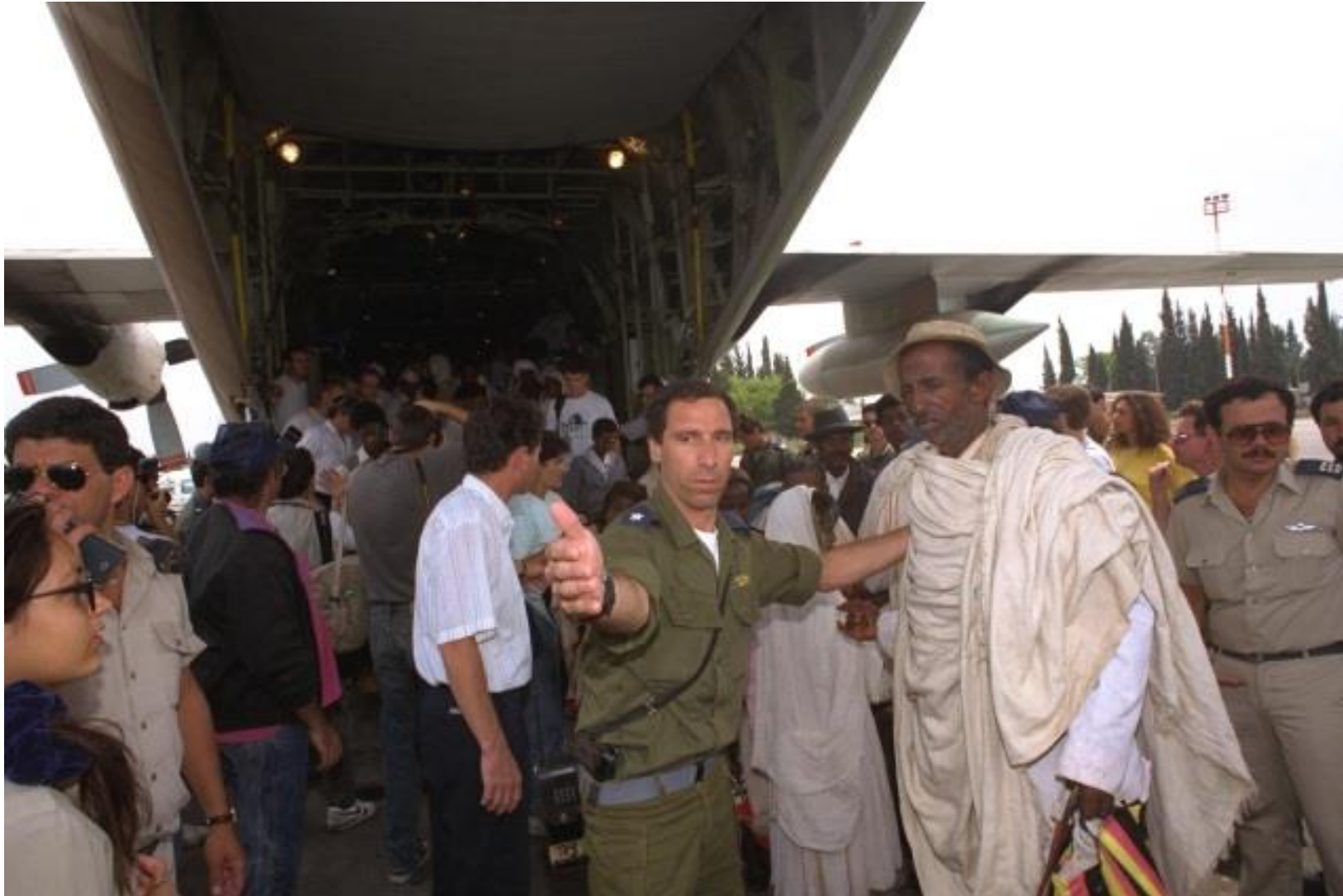
Operation Solomon https://upload.wikimedia.org/wikipedia/commons/9/96/Flickr - Government Press Office (GPO) - IDF OFFICER HELPING ELDERLY ETHIOPIANS OUT OF THE HERCULES AIRPLANE.jpg