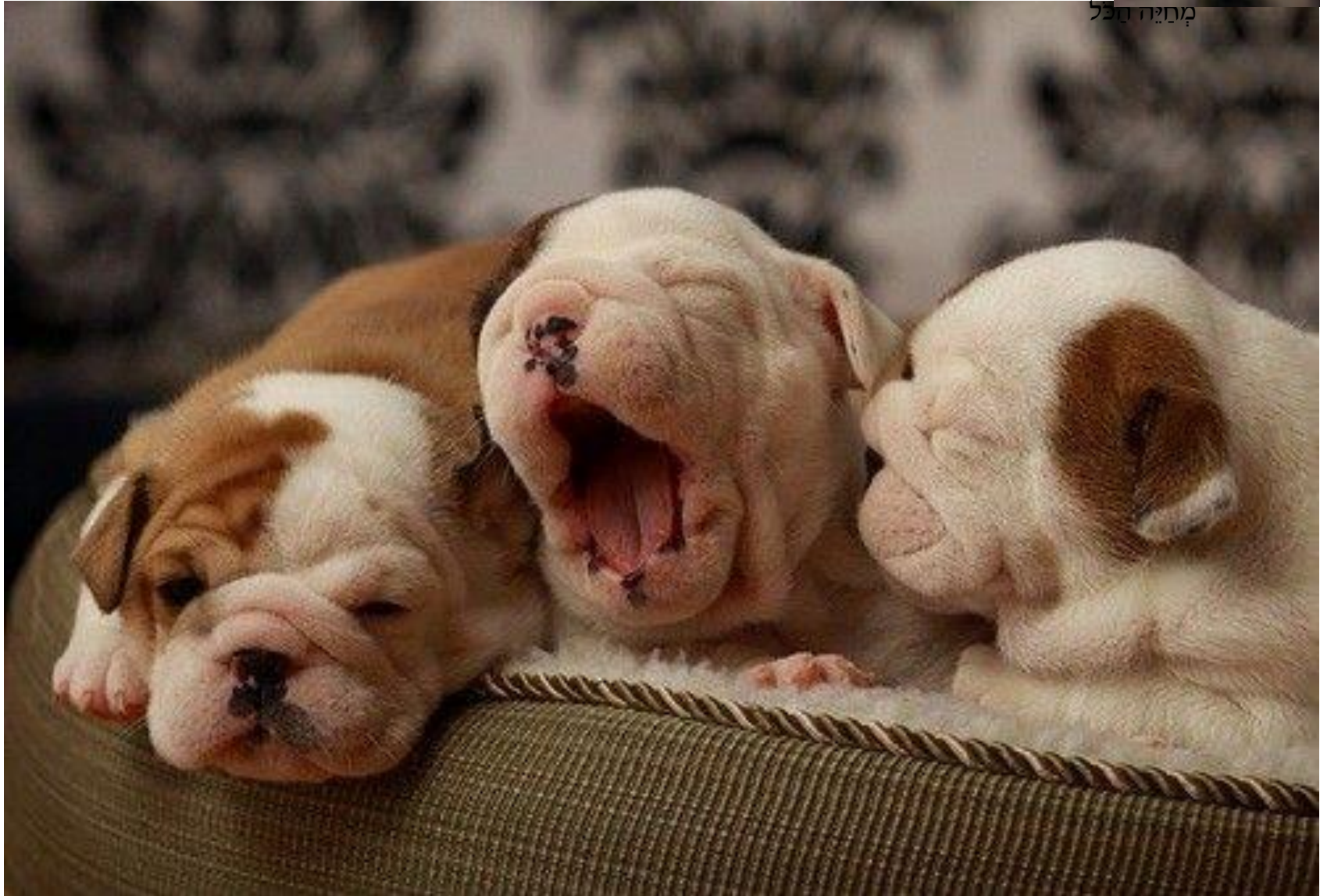
New born puppies https://s-media-cache-ak0.pinimg.com/736x/6d/6d/c2/6d6dc20a79bbb39b64dc3a4068968b8.jpg