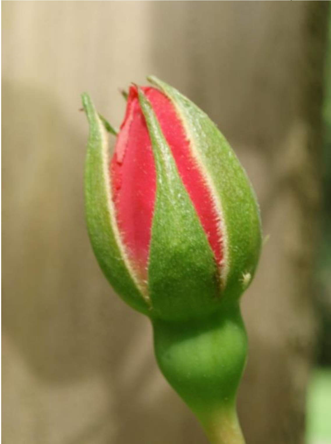
Life in bloom http://www.gardenthoughts.ca/gardenthoughts.ca/wp-content/uploads/2010/07/P6230038.jpg

מַחִיָּה הַכֹּל – gives life to all. לא מַחִיָּה הַכֹּל and מַחִיָּה הַכֹּל