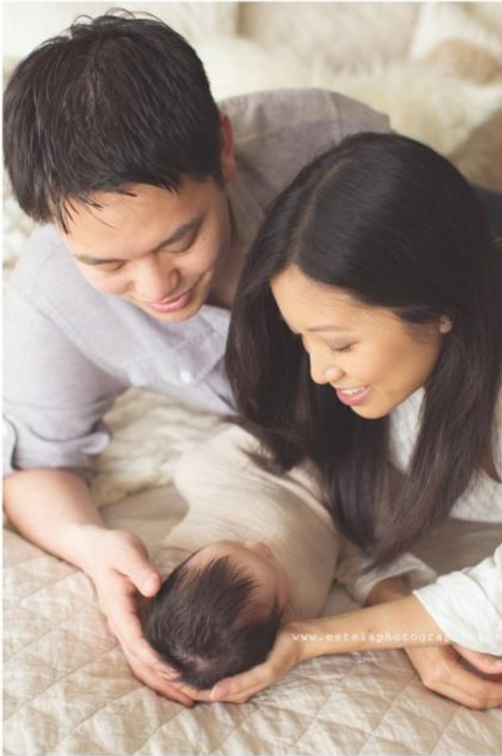
New born baby

http://www.estelaphotography.com/wp-content/uploads/2015/05/22-2775-post/15-05-Adrienne-New-263-Edit-estelaphotography(pp_w1097_h1550).jpg