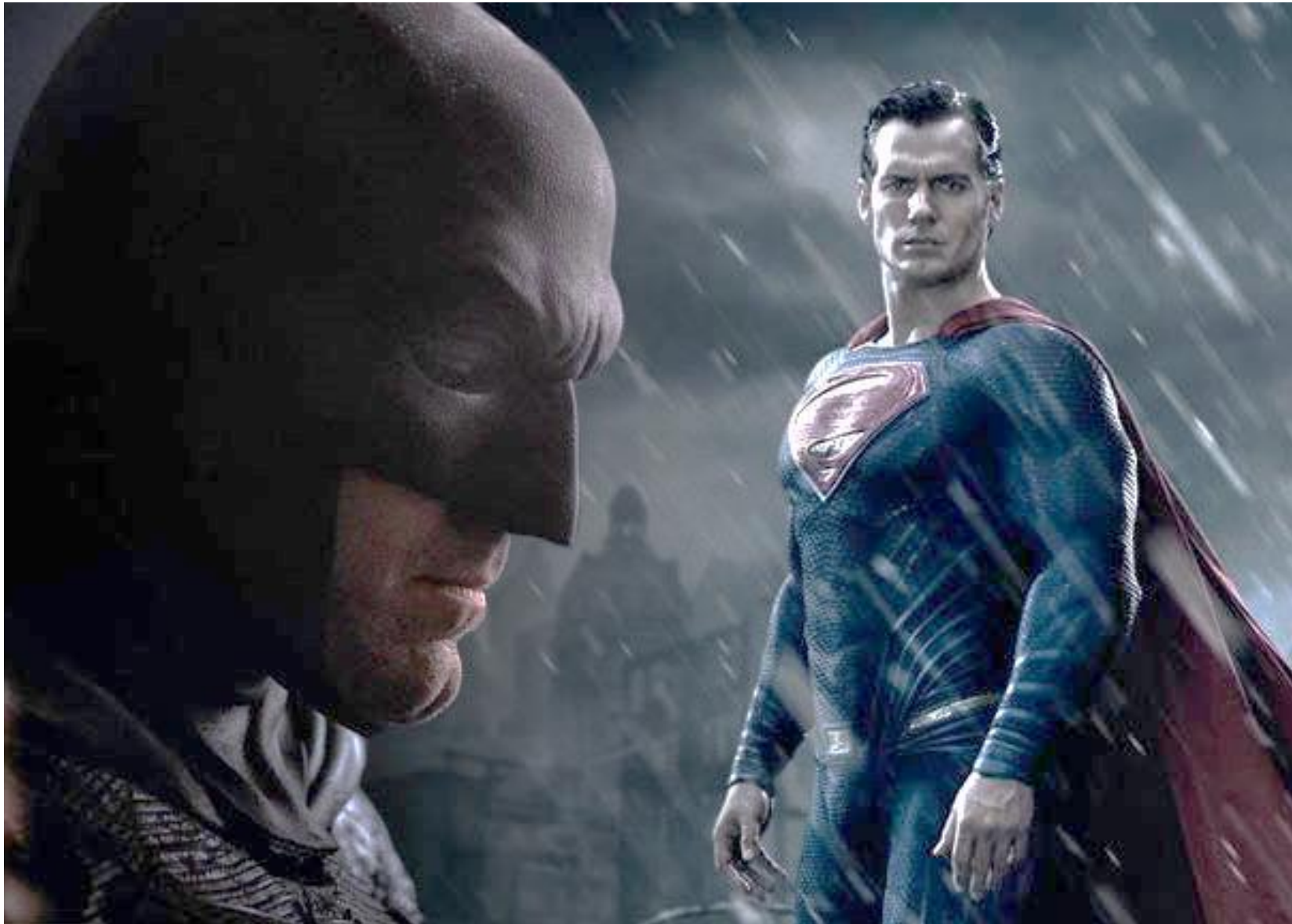
(Batman and Superman) http://cdn.arn.com.au/media/19083/batman-v-superman.jpg