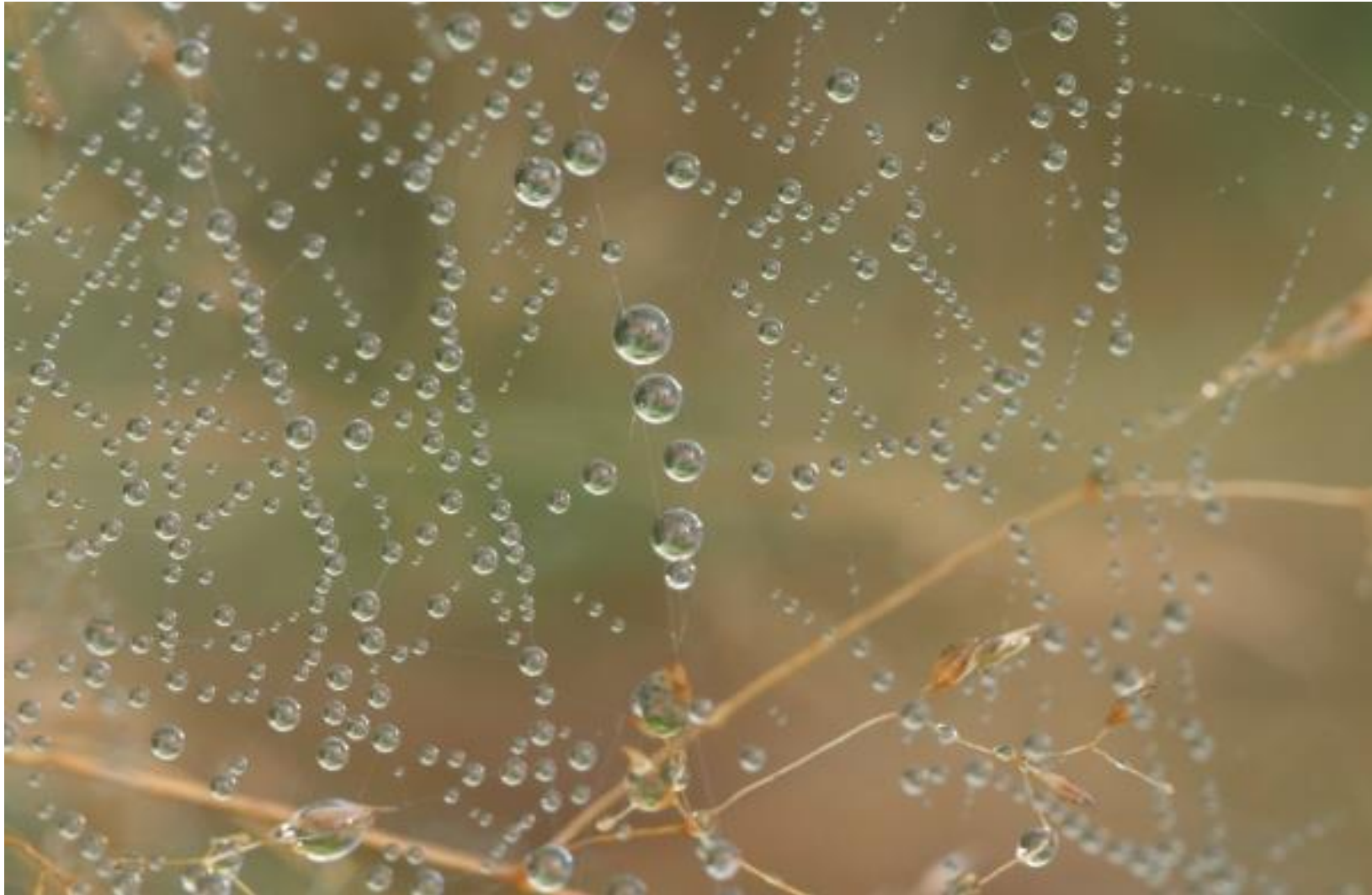
https://upload.wikimedia.org/wikipedia/commons/8/8b/Dew_drops_LC0107.jpg dew on a spider web