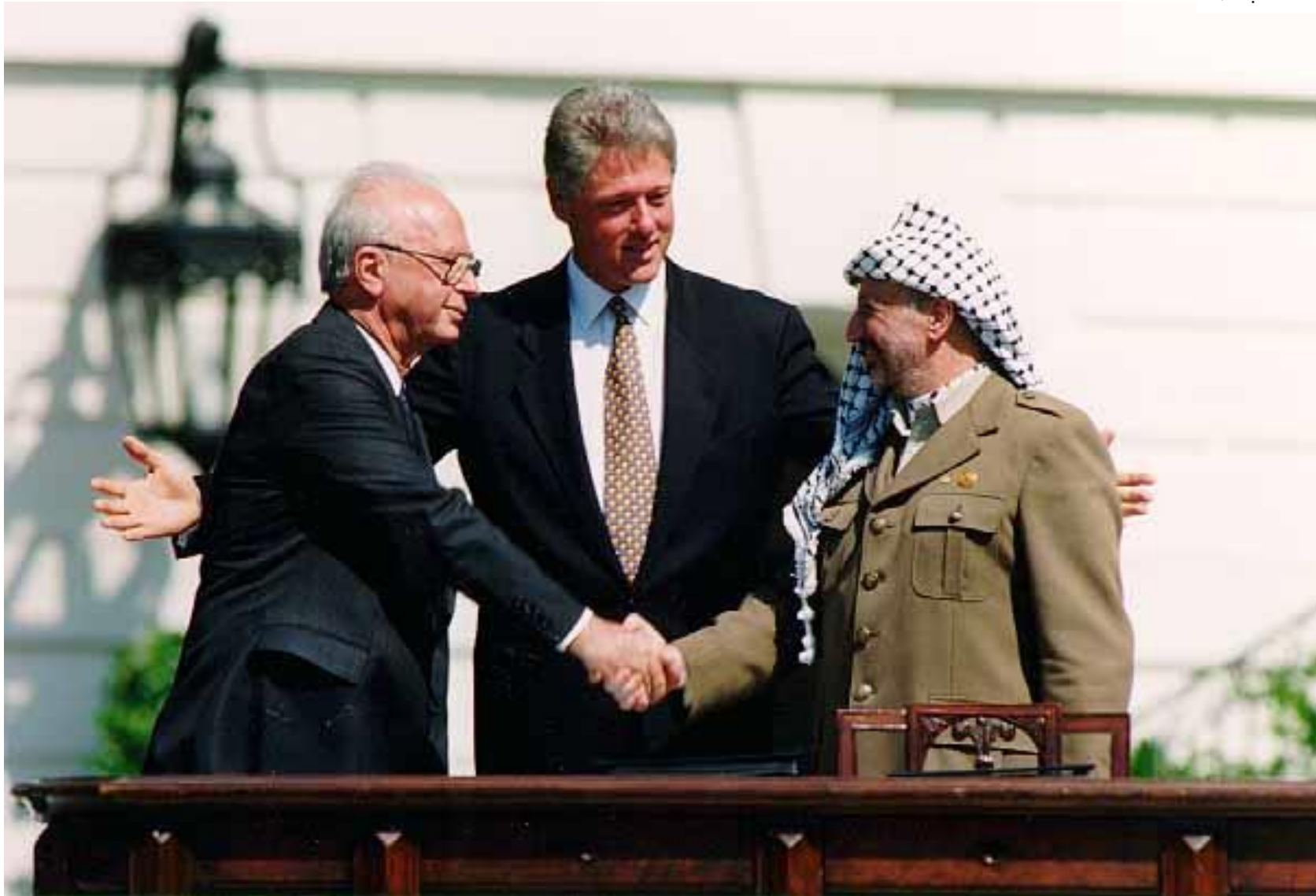
Yitzhak Rabin wanted to conquer peace

https://upload.wikimedia.org/wikipedia/commons/e/e7/Flickr - Israel Defense Forces - Life of Lt. Gen. Yitzhak Rabin, 7th IDF Chief of Staff in photos (8).jpg